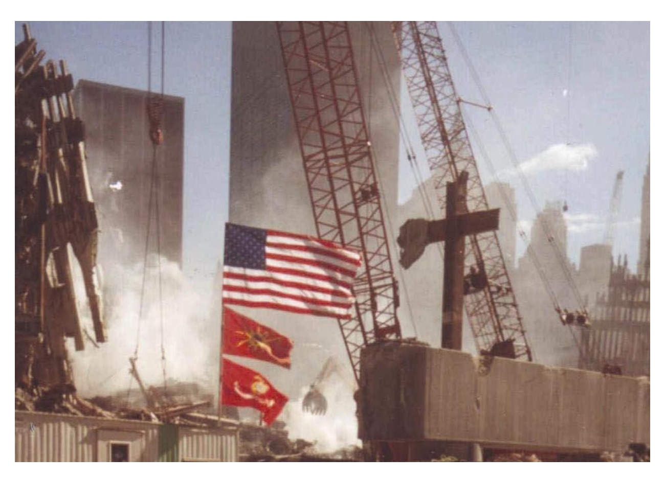
Ground Zero Cross on West Side Highway -- now in 9/11 Museum.